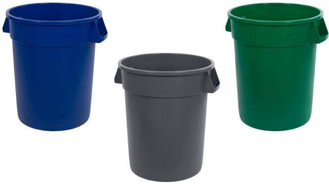
32 gal round blue, grey and green bin

42 gal blue bin Used for cooking kitchens with high recycling volumes