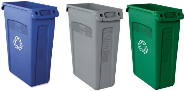
23 gal tall rectangle