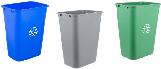
10 & 14 gal blue, grey and green bin