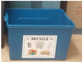
14 gal tub