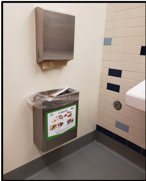
One green bin only for paper towels works for most bathrooms.